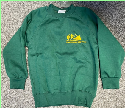
Nursery to Year 5 jumper

Year 6 will no longer be wearing black from September. Instead, they will wear a green V-neck jumper/cardigan and a tie—we will be providing every year 6 pupil with a tie at no cost to parents. These will be sent home with pupils in July.