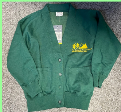
Nursery to Year 6 cardigan