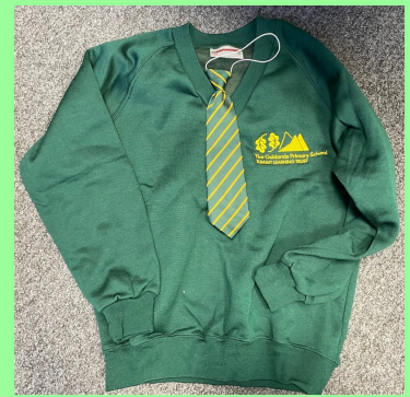
Year 6 V-neck jumper and tie